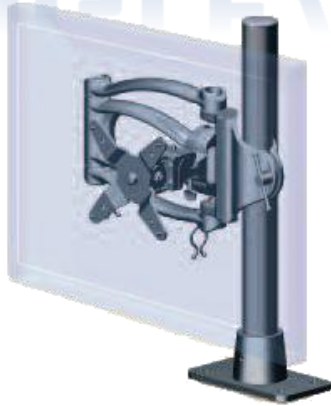
MODEL NUMBER 200-F16-B01