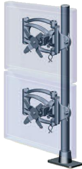
MODEL NUMBER 200-F28-B11

Ergotech Group, Inc 877-523-2767 8 Westchester Plaza, Elmsford, NY 10523 sales@ergotechgroup.com www.ergotechgroup.com